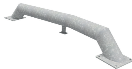
AMTR-N ANGLED guide

The AMTR-N STRAIGHT steel guide is 1840 mm long. Its frame and feet are made of circular steel profiles with a diameter of 159 mm. The whole is attached to square bases made of flat sheet metal.