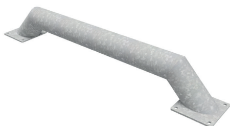
AMTR-N STRAIGHT guide

The AMTR-N STRAIGHT steel guide is 1840 mm long. Its frame and feet are made of circular steel profiles with a diameter of 159 mm. The whole is attached to square bases made of flat sheet metal.